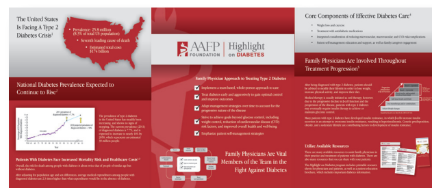
TABLE-TOP BOOTH DISPLAY