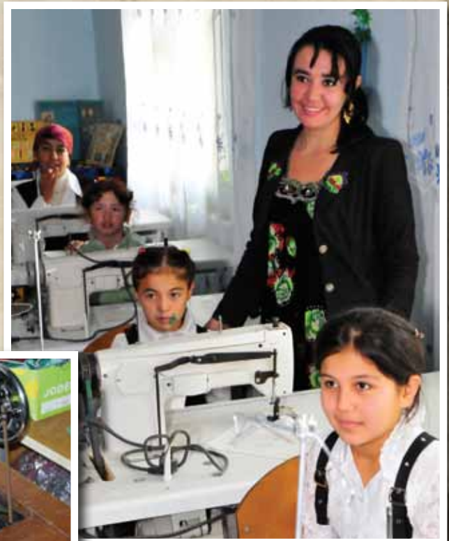
INSET: An example of one of the old sewing machines at the Rudaki school.