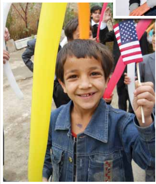
ABOVE: Making an impression on the future of Tajikistan! RIGHT: Students at the Rudaki School for the Hearing Impaired examine their new sewing machines, which were provided by the PWH Children's Project.