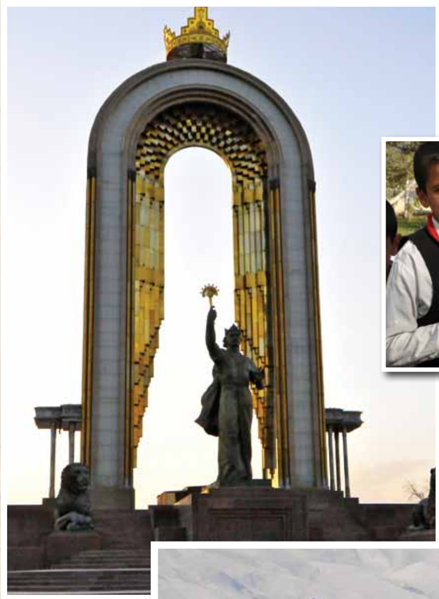
LEFT: A monument of King Somoni, the legendary founder of Tajikistan. The Tajik currency also bears his name. BELOW: Boys in school uniforms sing a patriotic song. BOTTOM: Tajikistan is a mostly Muslim nation. Here, a village elder leads young men in an afternoon prayer.