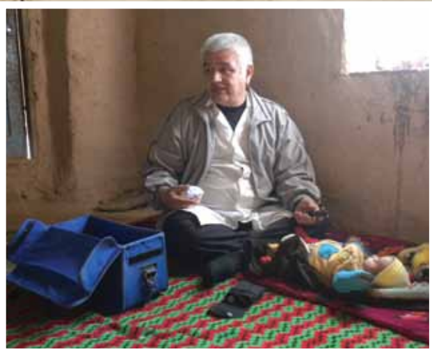
ABOVE: The medical-education team traveled in small groups with local family physicians to visit patients in their homes and observed the specialty of Family Medicine being practiced in rural Tajikistan. RIGHT: A local family physician shares the story of this newborn baby, whom she delivered only a few days earlier. In Tajikistan, family physicians will make home visits 3-4 times a day to check up on patients.