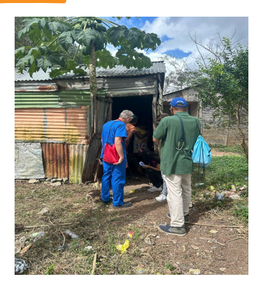
Home Visits 18 patients