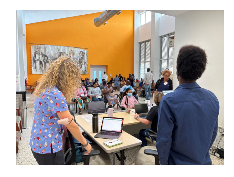
OWS Clinic 88 patients