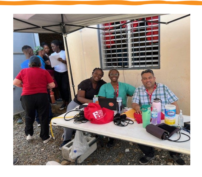
Batey Outreach 256 patients