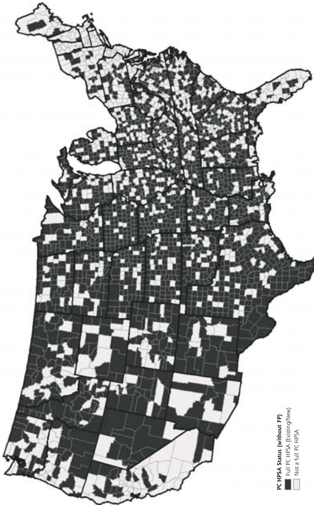
Figure 2. 1999 distribution of counties with full or partial primary care health personnel shortage designation without family physicians.

PC = primary care; FP = family physicians; HPSA = health professional shortage area.